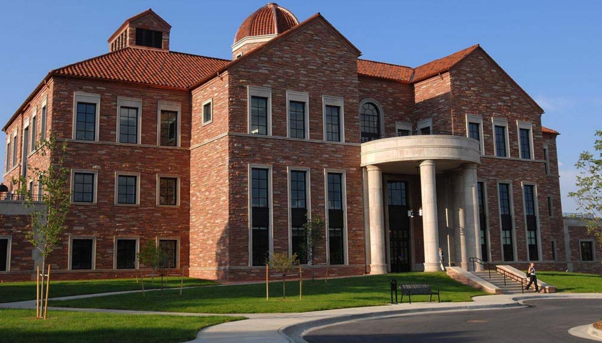
The Koelbel Building - Leeds School of Business