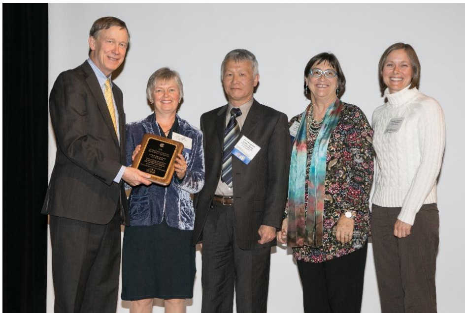
Colorado Governor John Hickenlooper with Award winners from the Centers for Disease Controls