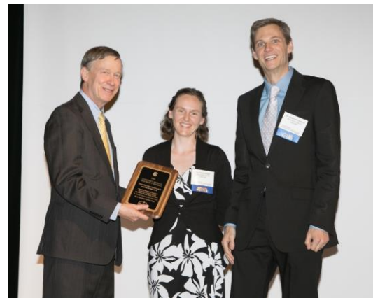
The reception celebration and Governor John Hickenlooper with Award winners from JILA

"It was absolutely humbling to be in a room full of such influential, dedicated, and high-caliber scientists. I appreciate the opportunity to network with these leaders and to explore ways that we can share their knowledge and experiences with our students and inspire the next generation of STEM professionals."