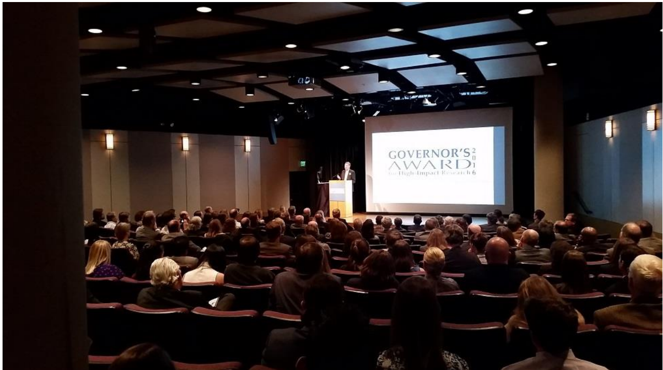
The audience hears congratulatory remarks from Governor John Hickenlooper